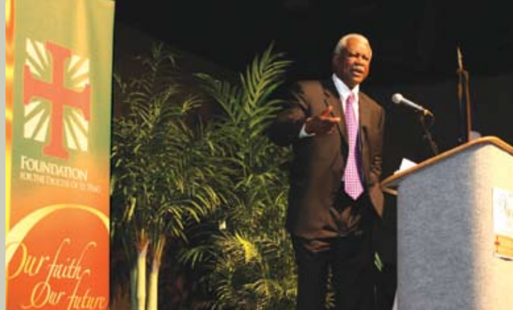
Basketball legend Nolan Richardson delivers keynote speech.