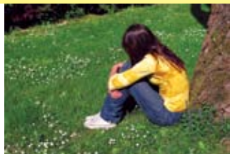
▼ Catholic Counseling Services has served thousands of families in their deepest time of need.